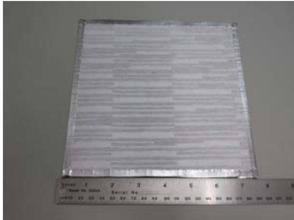
Photo Documentation – The product sample specimen is photographed immediately following specimen preparation and prior to initiating the conditioning period. Typically, the top and bottom faces of the specimen are photographed. Bottom faces may show a stainless steel plate or other substrate if prescribed by the standard.